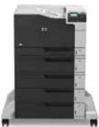
HP Color LaserJet Enterprise M750xh