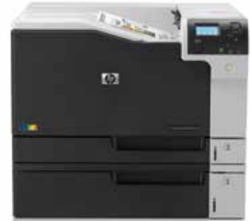
HP Color LaserJet Enterprise M750n

Mobile printing capability: 10 HP ePrint, Apple AirPrint™