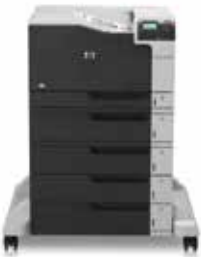
HP Color LaserJet Enterprise M750dn